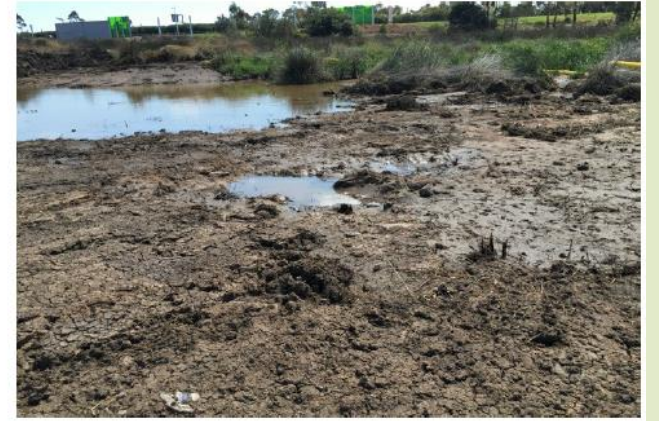
The removal of the causeway by earth-moving equipment has created a lot of mud.