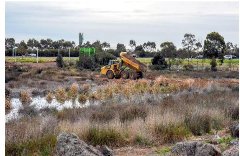
The developer at The Islands, Waterhaven Estate, Point Cook, dumped tonnes of earth across Skeleton Creek, effectively blocking it - without first consulting or informing local residents and our Friends group.